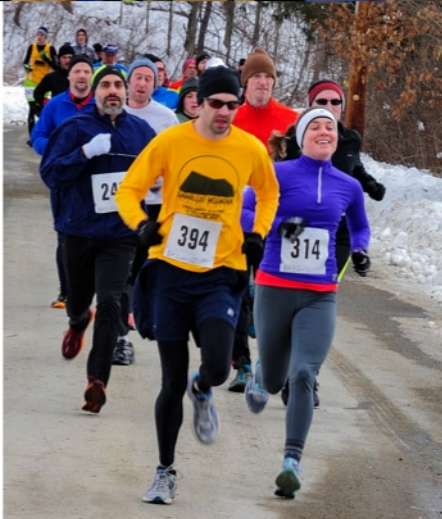
Runners checking in, coming and going