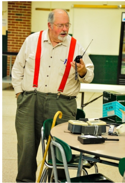
Who wants to bid on this HT?