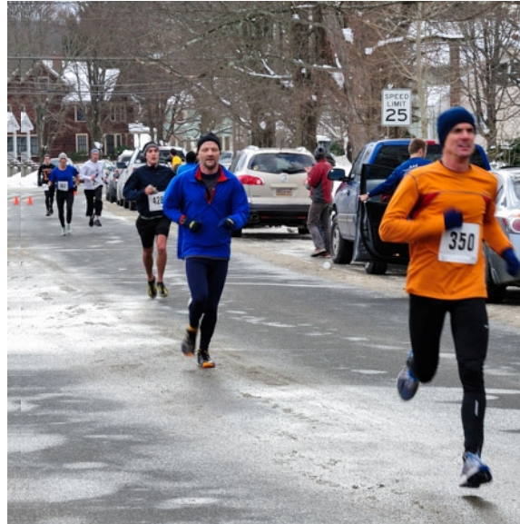
The other runners finally arrive at the finish