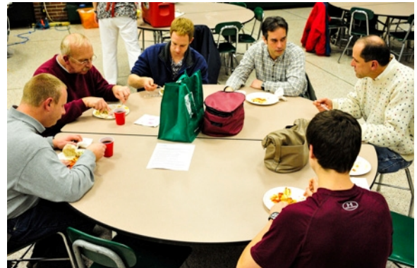
Enjoying the pot luck