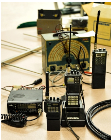
More auction items