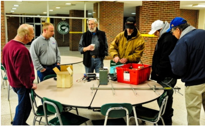
Looking over the auction items