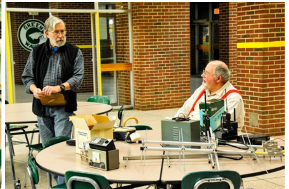
AI N1AW and Carter WA1TVS