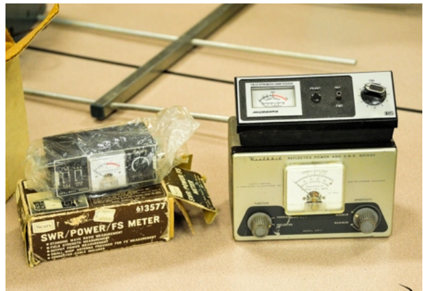
A few of the auction items