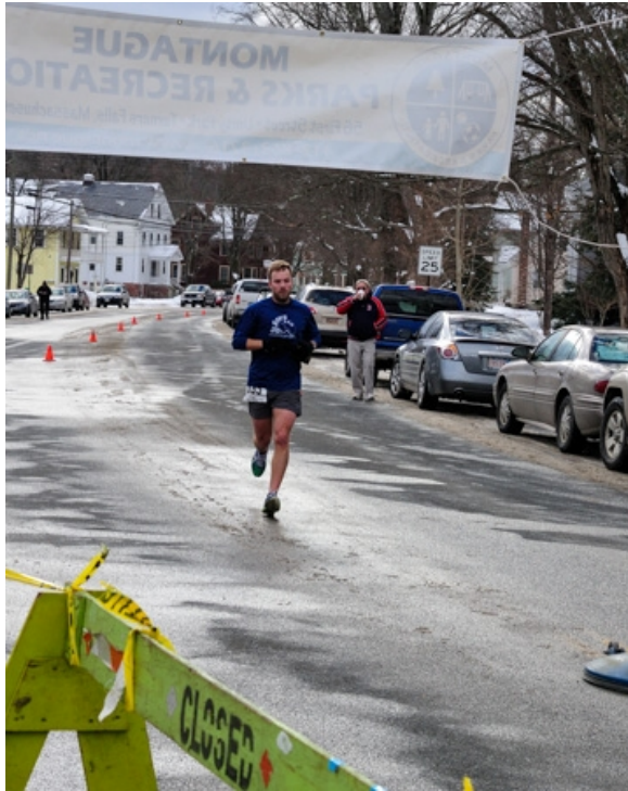
The winner at the finish line – no other runners in sight