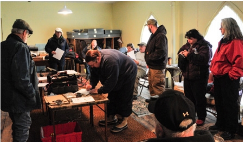
Checking in and getting assignments

Note: the Vermonters who came down to help us do a similar thing, but on a grander scale. They provide communications in Vermont for two Super-Marathon runs and bike races (50 and 100 miles!) in July and September. They need lots of volunteers for this, we will probably hear from them again.